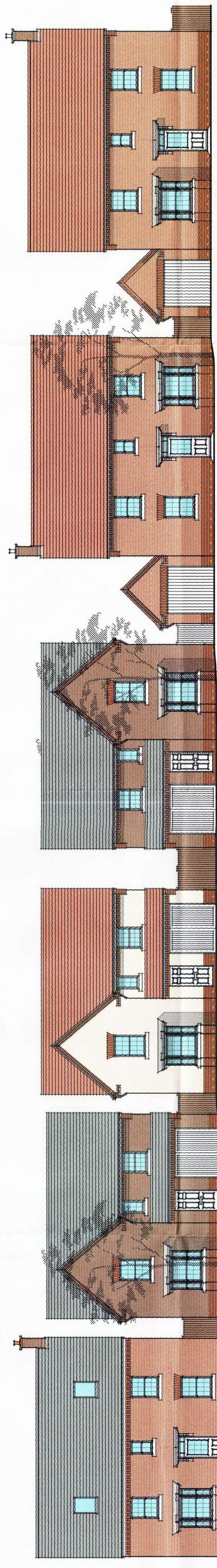
Type H436 Plot 6